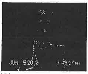
Video excerpts from pages 1 to 199 of the Weakland deposition.